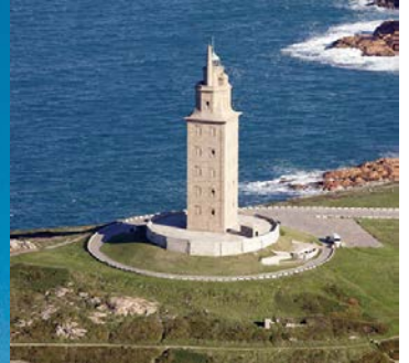
Santiago de Compostela