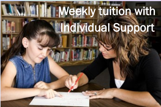
Weekly tuition with Individual Support

More than learning an essential foreign language, this daunting adventure becomes an enjoyable and maturing experience.